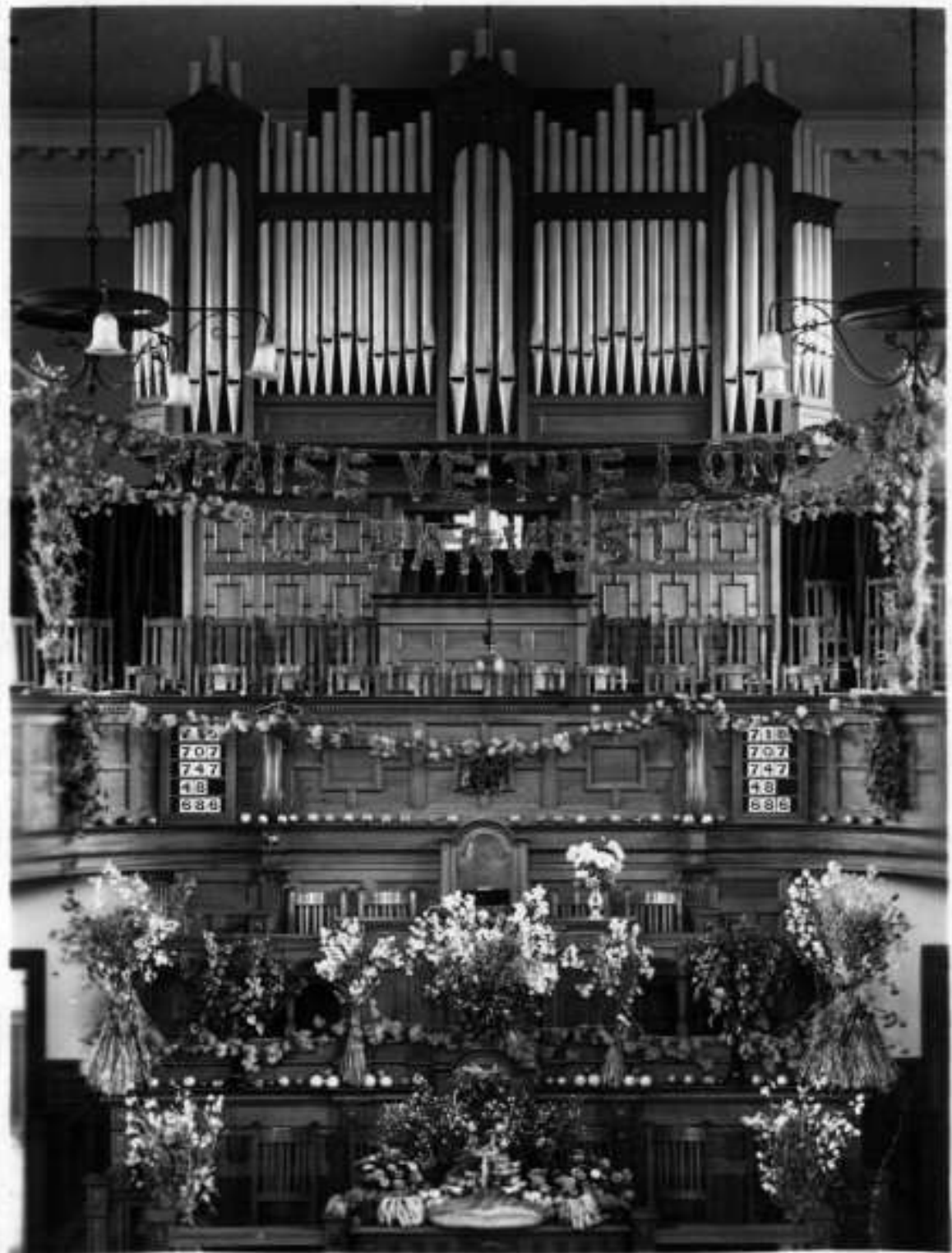
Harvest Festival – Date Unknown