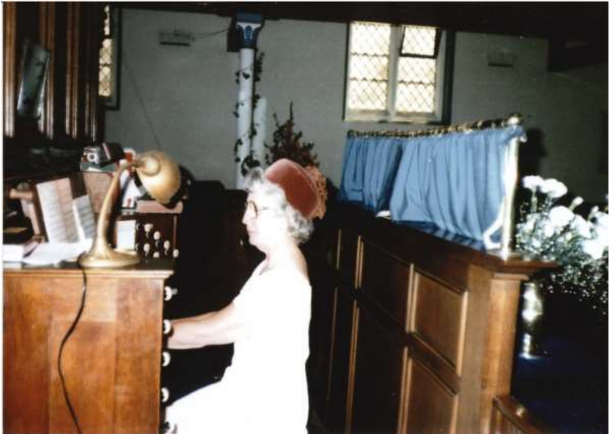
An interior photo from a newspaper just before the refurbishment in the late 1980s.